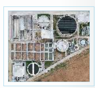
SET-Effluent Treatment Plant (ETP) for Dairy