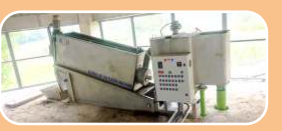
Automated Sludge Dewatering System